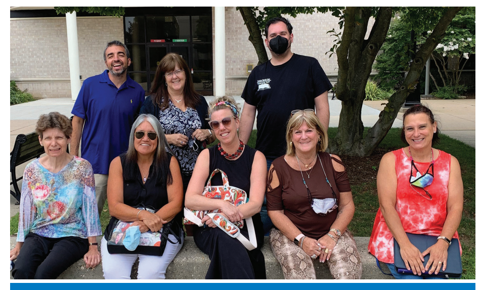
Here is the Hofstra University bargaing committedd that delivered a four-year contract

It was not an easy negotiation. The university wanted numerous givebacks, including the removal of 403 (b) employer/employee contributions from the contact. The union fought back, however, and it maintained this provision. The contributions are 8%for the employer and 4% for our members.