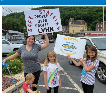
The June 11th demonstration.