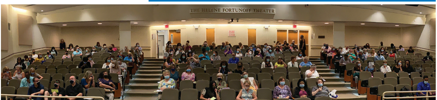
Members at Hofstra observing CDC spacing guidelines at theri ratification meeting.