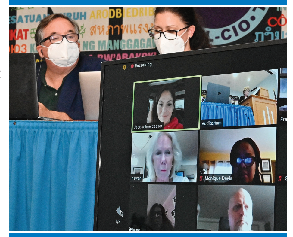
Due to the pandemic many members chose to attend the meeting via Zoom rather than in person.